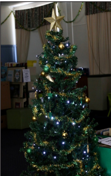
Staff and students getting into the Festive spirit