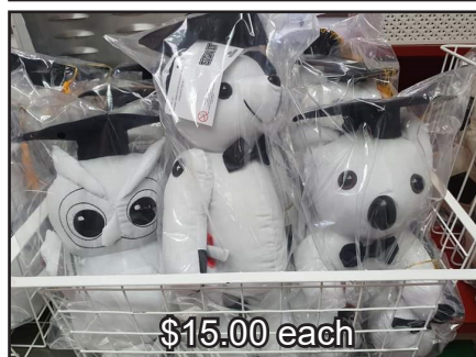
Bears Owls and Koalas