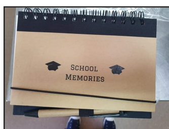
Frame and Notebooks