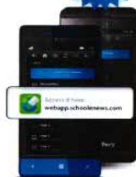
Windows Phone & Blackberry Devices