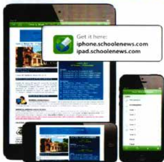
iOS Devices (iPhone, iPad, iPod Touch)

Step 2: Search for your school name inside the app