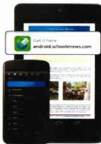
Android Devices (Galaxy, Nexus etc)