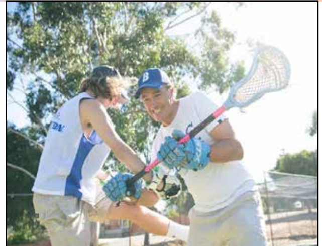
Weekly tip: winning and losing well

The challenge is running from 1/6/19 - 31/08/19. It's very easy to start donating blood, just follow the steps online at www.donateblood.com.au .