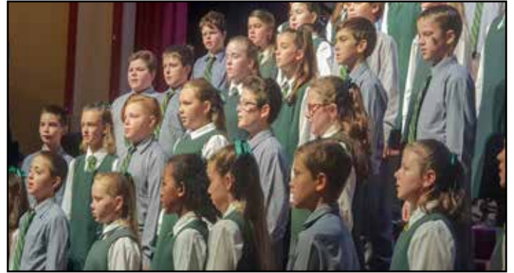
TAMWORTH EISTEDDFOD 2019