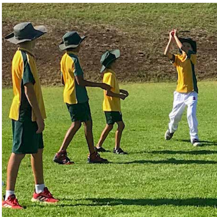
Jackson catching the ball on the full in a warm up