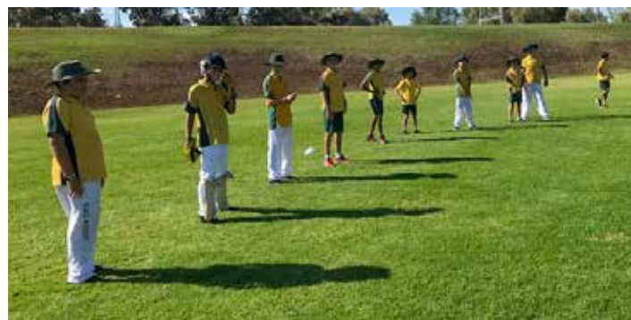
Team warming up