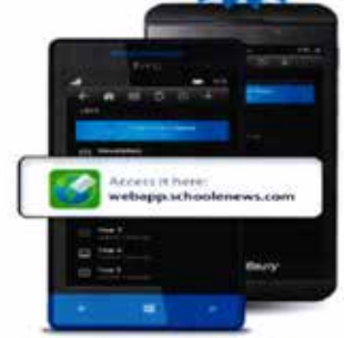
Windows Phone & BlackBerry Devices