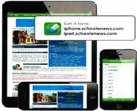
iOS Devices (iPhone, iPad, iPod Touch)

Hundreds of Australian schools inside Can't find your school? Sign up at schoolenews.com