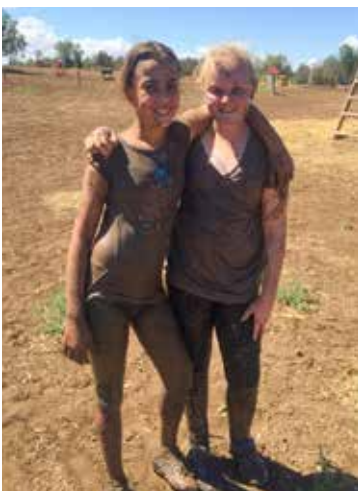
Year 6 Mud Run