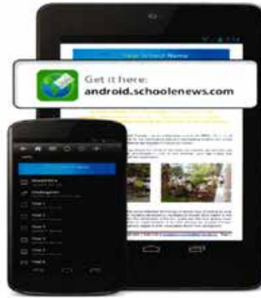
Android Devices (Galaxy, Nexus etc)