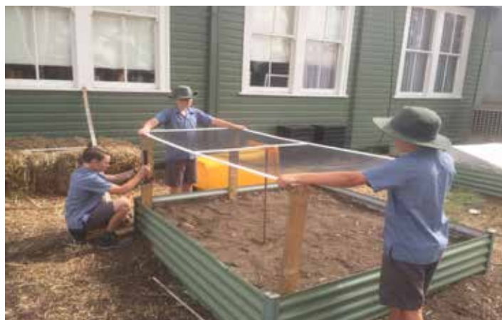
Class S3 36

This term S3 36 have been studying greenhouses. Students were given the challenge to design a greenhouse to effectively grow a vegetable of their choice.