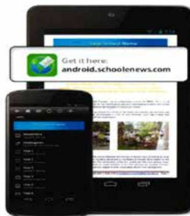
Android Devices (Galaxy, Nexus etc)