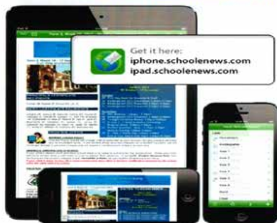
iOS Devices (iPhone, iPad, iPod Touch)

Step 2: Search for your school name inside the app