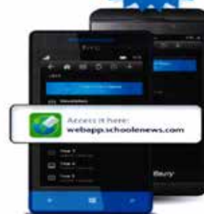
Windows Phone & Blackberry Devices